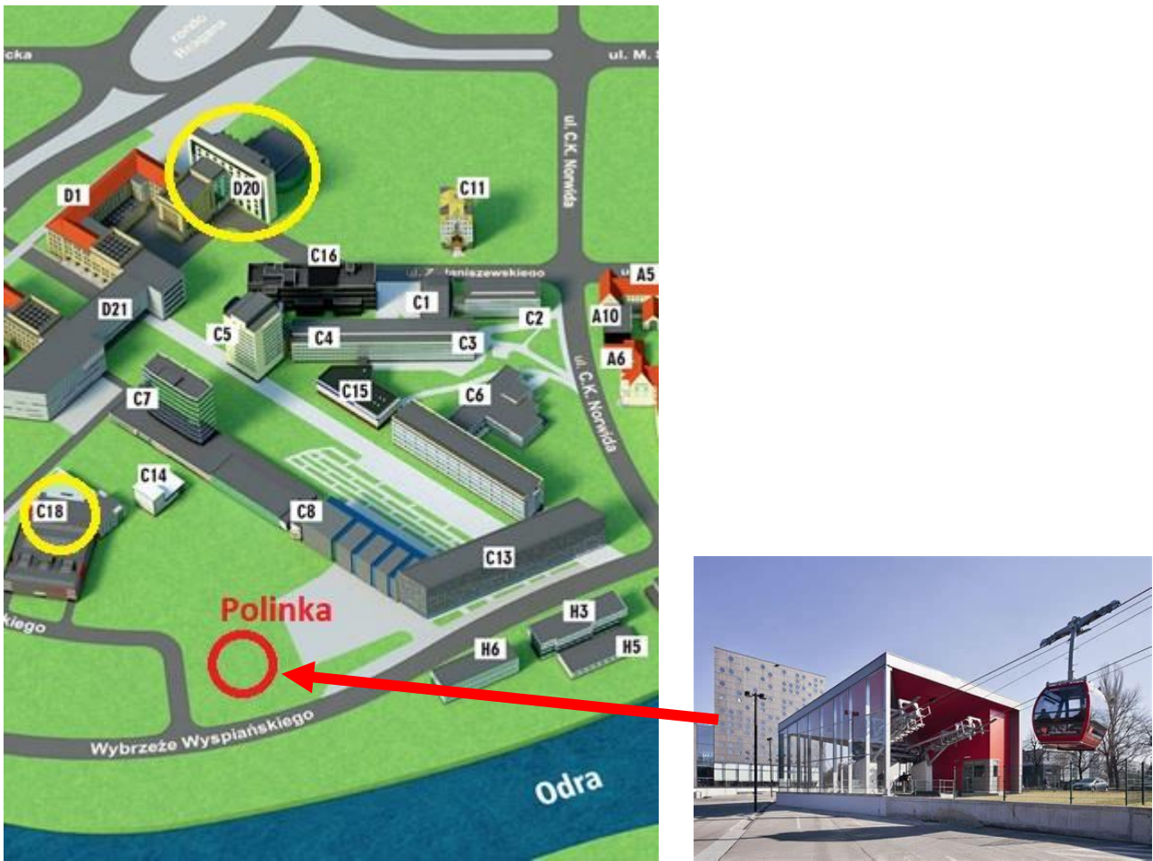
Fig. 3. “Polinka” cable car station

GEO 3EM is located in other part of the Wrocław University of Science and Technology campus. You can get there by cable car “Polinka” from the main campus from the station located at the C-13 building.– Fig 3.